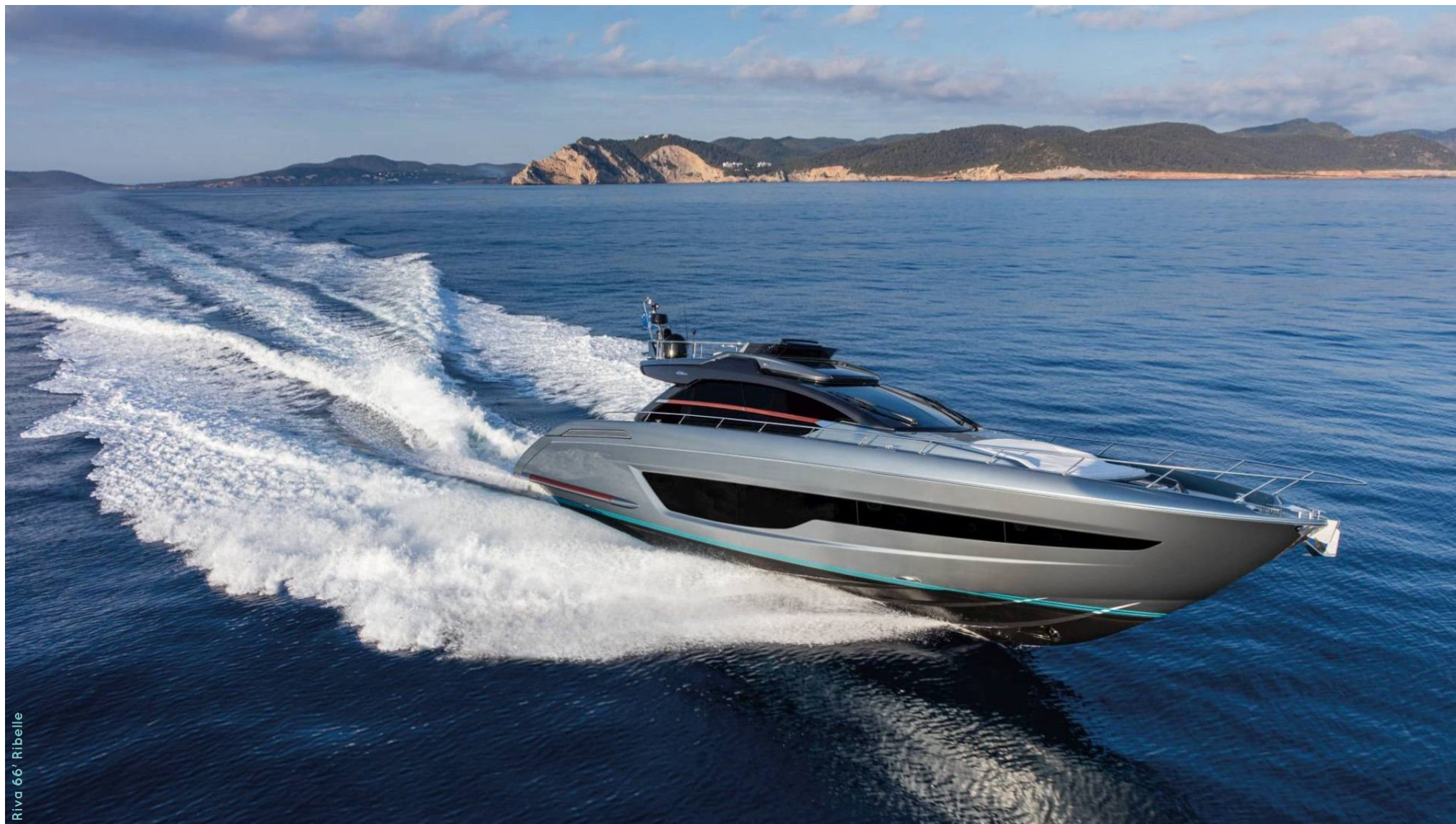
Riva 66' Ribelle