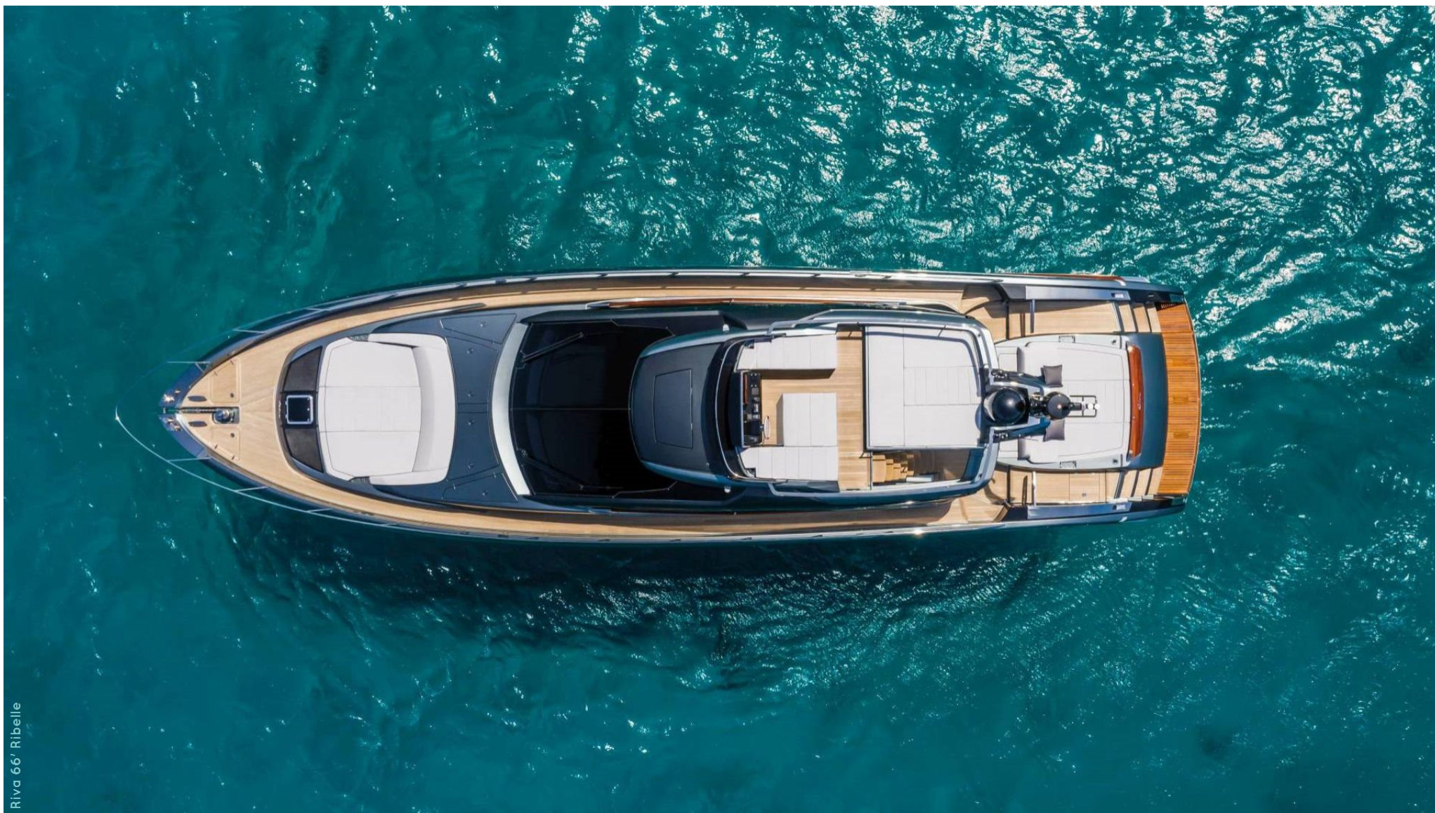
Riva 66' Ribelle